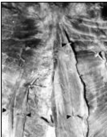
Figure 3 - Bilateral sternalis muscles. Note the sites of innervation of the muscles (arrows).

pectoralis major muscle, at the level of the third rib. The fibers of both bellies descended perpendicularly superficial to those of the right pectoralis major, 2 cm from midline. The 2 bellies fused to form a small aponeurosis, 5 cm long. Such aponeurosis was attached to the right external oblique muscle. The left muscle was innervated by the anterior cutaneous branches of the left second and fourth intercostal nerves. Both nerves penetrated the muscle close to its lateral border (Figure 3). The right muscle was innervated by the anterior cutaneous branch of the right fourth intercostal nerve that penetrated the middle of the medial belly. The lateral belly was innervated by a small branch arising from the right fourth intercostal nerve (Figure 3).