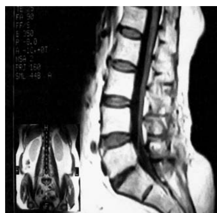
Figure 4 - Postoperative 3rd month, sagittal images of the cavity.

erosions into the intestinal tract, and even pathological fractures. 9 Stoll 10 reported a granulomatous abscess due to a retained sponge that caused low back pain 40 years after laminectomy was performed. The risk factors which predispose to infection after lumbar operations include inadequate sterilization of the operation region and surgical instruments, previous cutaneous infection at the operation region, perioperative contamination, forgotten foreign bodies (needle, lancet, sponge, cotton, and so on), instrumentation, inadequate immune response in patients, corticosteroid usage after operation and pseudomeningocele formation.