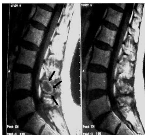
Figure 1 - Lesion signed with arrows. This appearance mimics an abscess.