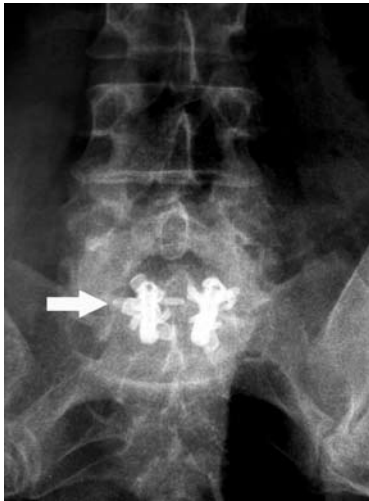
Figure 2 - An x-ray of B-TWIN expandable cages.