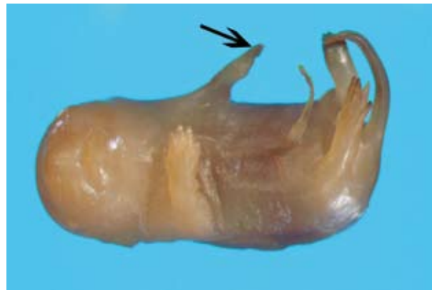
Figure 2 - A fetus with limb deformities from experimental group II, treated with 50 mg/kg/day gabapentin.

Results. The frequency of total number of fetuses, live fetuses, their weights, and resorbed fetuses, in experimental groups I and II, and the control group is summarized in Table 1. No significant differences were observed in mean number of live fetuses among the different studied groups. Significant dose-dependent fetal resorption was observed, and a dose-dependent weight reduction of treated fetuses was also observed (Table 1). Brachygnathia, deformities in vertebral column and limbs, exencephaly, and also fetuses with severe malformations were observed in experimental groups I and II (Table 1). Brachygnathia was the most prominent malformation in both treated groups. Our result showed that approximately 10% of fetuses in