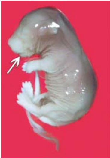
Figure 1 - A fetus with hypognathia (white arrow) from experimental group II, treated with 50 mg/kg/day gabapentin.