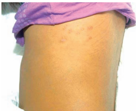
Figure 1 - Post inflammatory maculopapular lesions below the nipple on the left side at the T6 dermatome.

Case Report. A 17-year-old lady, a known case of sickle cell anemia since childhood on hydroxyurea, was admitted to the hospital with 10 days history of fever, vomiting, epigastric pain, body aches, and skin rash over the middle part of the left side of the chest. On examination, she was ill looking with a temperature of 38°C, respiratory rate of 20/min, heart rate of 112/min, and blood pressure 97/56 mm Hg with mild jaundice and pallor. Her chest, cardiovascular including abdomen, and neurological examination were unremarkable, with no meningeal signs. There was a vesicular type of rash below the nipple and over the left chest involving the back as well (Figure 1). She was diagnosed as herpes zoster and was started on acyclovir with good hydration and analgesia. On the third day of admission, she started to develop weakness and decreased sensation of the right leg. The possibility of CNS sickle cell crises was suspected