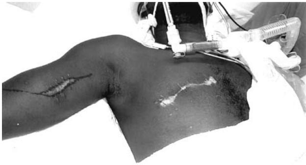
Figure 1 - Pre-operative photograph illustrating the path of the gunshot across the patient's chest with the entry wound in the medial arm.