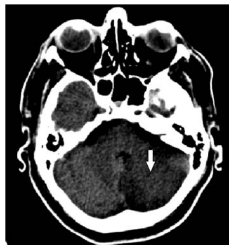
Figure 3 - Computed tomography of head showing large left cerebellar acute infarction.