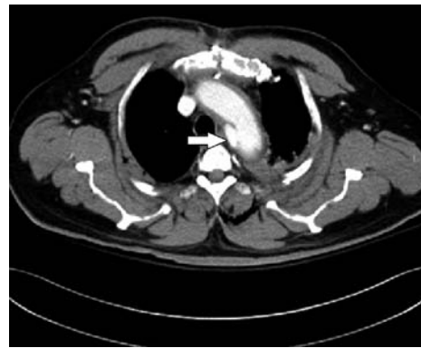
Figure 1 - Axial CT showing the lesion; complex transection with an irregular lobulated pseudoaneurysm in the undersurface of the aorta immediately distal to the LSA, measuring 2.6 x 2.5 x 2.2 cm. LSA - left subclavian artery.

Upon attempting to wean him of the ventilator 12 hours after the procedure, it was discovered that he could not move his upper and lower limbs, with no response to painful stimuli, and unable to answer questions using eye movements. He was immediately sent for a brain CT angiogram that showed normal size right vertebral artery but attenuated left vertebral artery, meeting to form a normally-seen basilar artery with a large left cerebellar acute infarction extending into the medulla and proximal spinal cord (Figure 3). A CT neck angiogram showed 2 stents (proximal short and distal long stent) covering the orifice of the LSA and terminating in the descending aorta at the diaphragmatic hiatus, excluding the false aneurysm. Unfortunately, the excluded LSA was only partially opacified and could not be assessed further. He remains ventilator-dependent, and responds to verbal commands with his eyes.