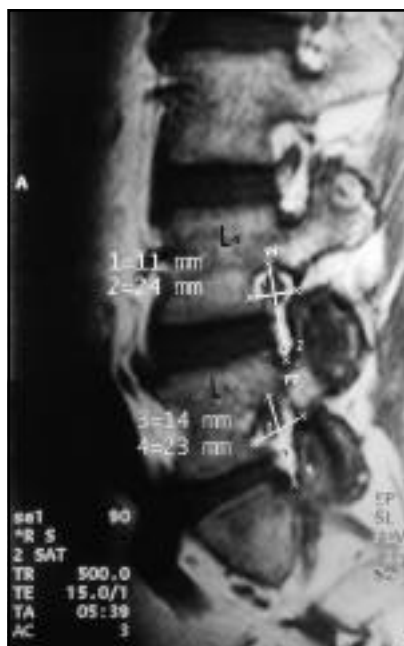
Figure 1 - Sagittal MR image of the lumbar spine, demonstrates positions of markers for measuring the foramina heights (FH) between L4/L5.