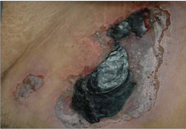
Figure 1 - Extensive skin necrosis with eschar formation on anterior abdominal wall.