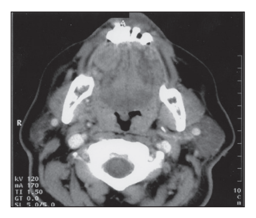
Figure 2 - A CT scan of the oral cavity and the neck at the level of the floor of the mouth, showing the tumor localized in the floor of the mouth.