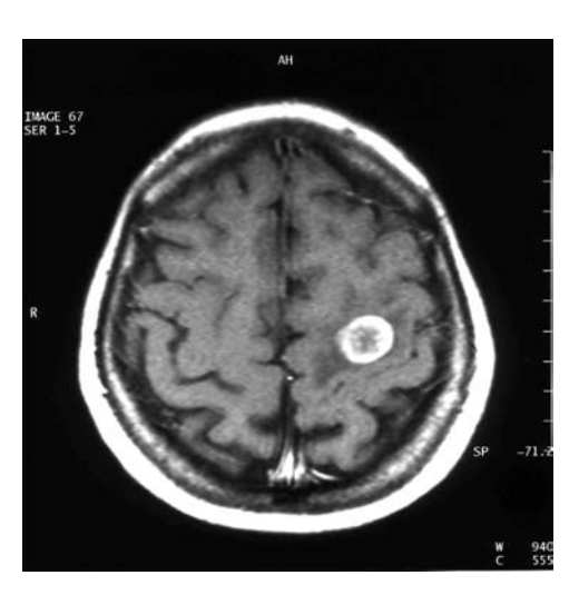
Figure 1 - The lesion is seen in preoperative contrast-enhanced T1 axial MRI section.