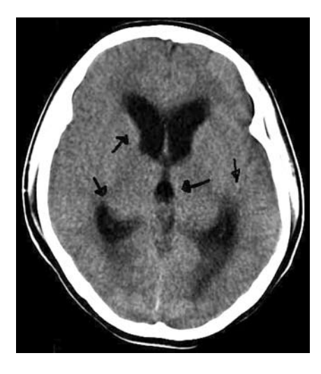
Figure 1 - Post antituberculosis therapy and before initiation of urokinase therapy CT scan shows basal meningeal enhancement and hydrocephalus.

2.5-4.5 mmol/L), chloride 129 mg/dl, total cell counts 320×106/L, and white cell counts 302×106/L (NR <10x10<sup>6</sup>/L). Cytological examination in CSF showed neutrophile granulocyte 0.69, lymphocyte 0.31, and acid-fast bacilli negative. The pressure of CSF was 220 mm H<sub>2</sub>O (NR 50-180 mmH<sub>2</sub>O). She was admitted to the hospital because meningitis was suspected. The results of CT of the head and sinus area, and the chest radiograph were normal. The levels of electrolytes, the results of kidney, and liver-function tests, and the levels of total protein and albumin were normal. Blood cultures and cultures of CSF, and serologic analyses were negative. A presumptive diagnosis of TB meningitis was made, and she was initially treated with isoniazid 0.3 g, rifampicin 0.45 g, pyrazinamide 0.75 g, ethambutol 1.0 g per day and intrathecally isoniazid 0.1 g twice a week. The headache gradually resolved, and the antibiotic