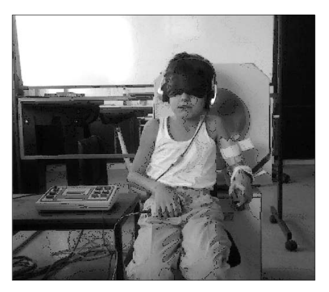
Figure 1 - Illustrates the positions in which the measurements were carried out.

Measurements were carried out while the participants were sitting, with thigh and back supported, on a chair that was adjusted to their height so that their feet rest firmly on the floor (Figure 1). The start position was determined as 90° elbow flexion and the forearm supported complete shoulder abduction (0° shoulder abduction). The sitting position used during final measurements was determined after 5 pilot measurement trials to obtain the most accurate results. A passive angular movement of 2°/s was set for measurements.<sup>4</sup> The target angle to be measured was determined as the 10%-30%-90% of the shoulder passive abduction angle.<sup>1,5,9</sup> Before all measurements, shoulder passive angles that will be used in determining the target angles were recorded avoiding scapular