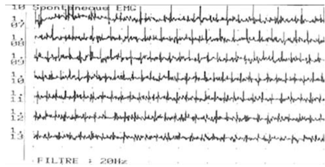
Figure 1 - Myotonic discharge in first dorsal interosseus muscle at rest in the electromyography.

Discussion. Hypothyroidism is the most common thyroidal affection. It occurs in 3.5/1000/year in women and 0.6/1000/year in men. 3 The autoimmune etiology and mainly the Hashimoto's thyroiditis is the main cause of acquired and spontaneous hypothyroidism in adults. Considering the unspecific character of the clinical manifestations of hypothyroidism, the diagnosis of autoimmune hypothyroiditis is usually