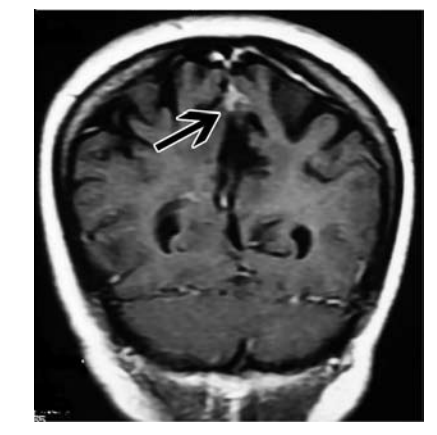
the control T1W MR images.