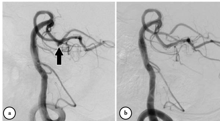
Figure 1 - A 57-year-old male with a ruptured peripheral posterior cerebral artery (PCA) aneurysm. a) Preoperative angiogram of the right vertebral artery shows a fusiform aneurysm (arrow) arising from the distal PCA. b) Postembolization angiogram of the right vertebral artery shows the occlusion of the aneurysm by stent-assisted coiling.