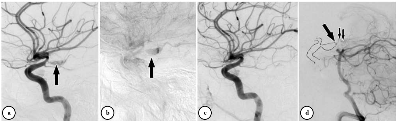
Figure 2 - A 36-year-old female with a distal ruptured anterior choroidal artery (AChA) aneurysm. a) Preoperative angiogram of the left internal carotid artery (ICA) shows an large fusiform aneurysm (arrow) arising from the distal AChA. b) Venous phase of the digital angiogram shows stasis of contrast in the aneurysm (arrow). c) Postembolization angiogram of the left ICA shows the occlusion of the aneurysm together with the AChA. d) Postembolization angiogram of the left vertebral artery shows the distal AChA (short arrows) filled in a retrograde fashion. The dashed line indicates the location of the aneurysm and the left ICA. A very slight residual filling of the aneurysm (long arrow) is also noted.