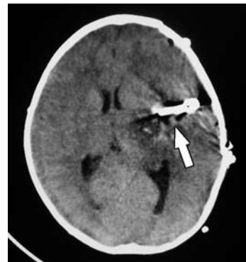
Figure 2 - Post-operative CT scan demonstrating the successful evacuation of the intracerebral hematoma and clipping of the left middle cerebral artery aneurysm. Some ischemic changes are noted in the left sylvian region and temporal lobe.