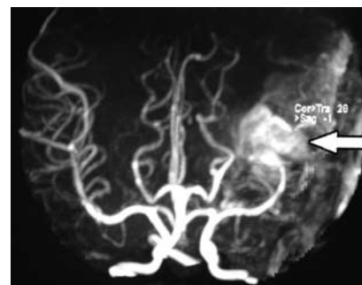
Figure 3 - Post-operative contrast enhanced 3-dimensional magnetic resonance angiography demonstrating the successful clipping of the left middle cerebral artery aneurysm with filling of the main artery and paucity of its branches.