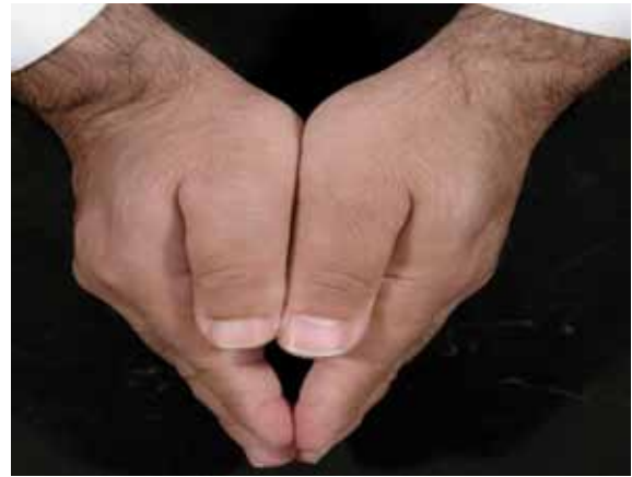
Figure 1 - Photograph of the patient's hands showing asymmetry with the right thumb smaller than left.

In a recent large series of DDMS (19 patients), 4 it was noticed that all patients experienced seizures, and the most common MRI findings were ipsilateral ventricle dilatation, CH, and cortical sulcus enlargement. It was more common in males, and this was thought to be due to the presence of circulating androgens in the