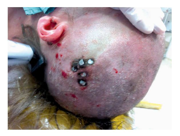
Figure 3 - Intraoperative image demonstrating the penetrating foreign bodies.