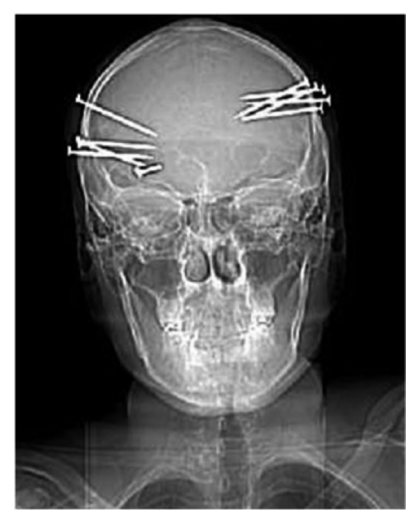
Figure 1 - Plain posterior-anterior skull x-ray demonstrating the foreign bodies.

what he had done. He was subsequently transferred to our tertiary care hospital for definitive neurosurgical management. On the way, he had a focal seizure. On arrival, he was immediately assessed by the neurosurgical service where his initial neurological examination revealed that he was oriented in all 3 spheres, with a Glasgow Coma Scale score of 15. His pupils were equal and reactive to light bilaterally, and he had full visual fields. Examination of his extraocular movements revealed a left abducens palsy. In addition, a left facial droop, left tongue deviation, right uvula deviation, mild dysarthria, subtle left sided motor weakness, and questionable decreased sensation over the left side were also noted. Due to the history of a focal seizure, he was