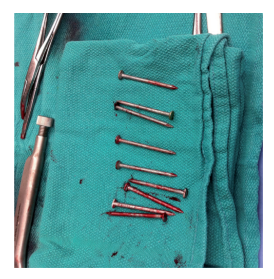
Figure 4 - Intraoperative image of foreign bodies.

Discussion. With the growing use of pneumatic nail guns both in the construction industry and by home consumers, penetrating craniofacial injuries caused by these devices are on the rise. Most of these injuries are primarily work related accident,<sup>2-4</sup> but they are also well-reported as intentionally self-inflicted.<sup>5</sup> Preoperative evaluation should always include thin cut CT scans allowing for multiplanar reconstruction. In addition, assessment of the cerebral vasculature is prudent especially if the nail appears to traverse a major vessel although the incidence of vascular injury secondary to nail gun injury is low. Trauma to the cerebrovascular system has been associated with a wide variety of pathologic consequences including: arterial dissection, pseudoaneurysm, arteriovenous