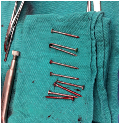
Figure 4 - Intraoperative image of foreign bodies.

Discussion. With the growing use of pneumatic nail guns both in the construction industry and by home consumers, penetrating craniofacial injuries caused by these devices are on the rise. Most of these injuries are primarily work related accident, 2,4 but they are also well-reported as intentionally self-inflicted. 5 Preoperative evaluation should always include thin cut CT scans allowing for multiplanar reconstruction. In addition, assessment of the cerebral vasculature is prudent especially if the nail appears to traverse a major vessel although the incidence of vascular injury secondary to nail gun injury is low. Trauma to the cerebrovascular system has been associated with a wide variety of pathologic consequences including: arterial dissection, pseudoaneurysm, arteriovenous