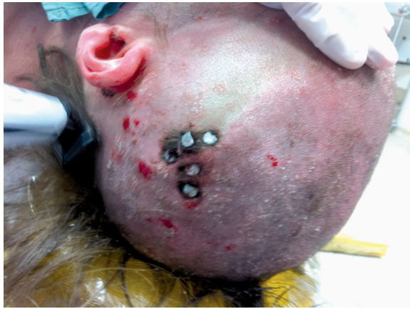
Figure 3 - Intraoperative image demonstrating the penetrating foreign bodies.