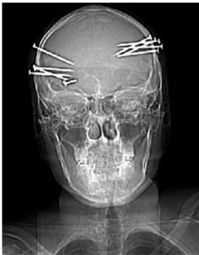
Figure 1 - Plain posterior-anterior skull x-ray demonstrating the foreign bodies.

what he had done. He was subsequently transferred to our tertiary care hospital for definitive neurosurgical management. On the way, he had a focal seizure. On arrival, he was immediately assessed by the neurosurgical service where his initial neurological examination revealed that he was oriented in all 3 spheres, with a Glasgow Coma Scale score of 15. His pupils were equal and reactive to light bilaterally, and he had full visual fields. Examination of his extraocular movements revealed a left abducens palsy. In addition, a left facial droop, left tongue deviation, right uvula deviation, mild dysarthria, subtle left sided motor weakness, and questionable decreased sensation over the left side were also noted. Due to the history of a focal seizure, he was