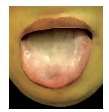
Figure 1 - An image showing the patient's tongue at initial presentation at a clinic in Riyadh, Saudi Arabia.