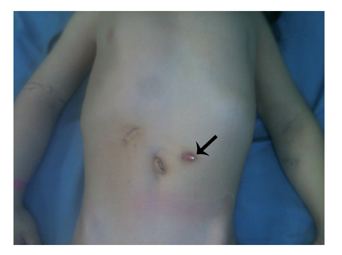
Figure 1 - Extrusion of the distal end of a ventriculoperitoneal shunt catheter (arrow tip) through the intact abdominal wall in a 5-year-old male with Apert syndrome.

Additional contributing factors for distal VPS migration may include the patients' age, as well as the length of the distal catheter inside the peritoneal cavity. For example, we noticed that most cases of distal VPS migration described in the literature have occurred