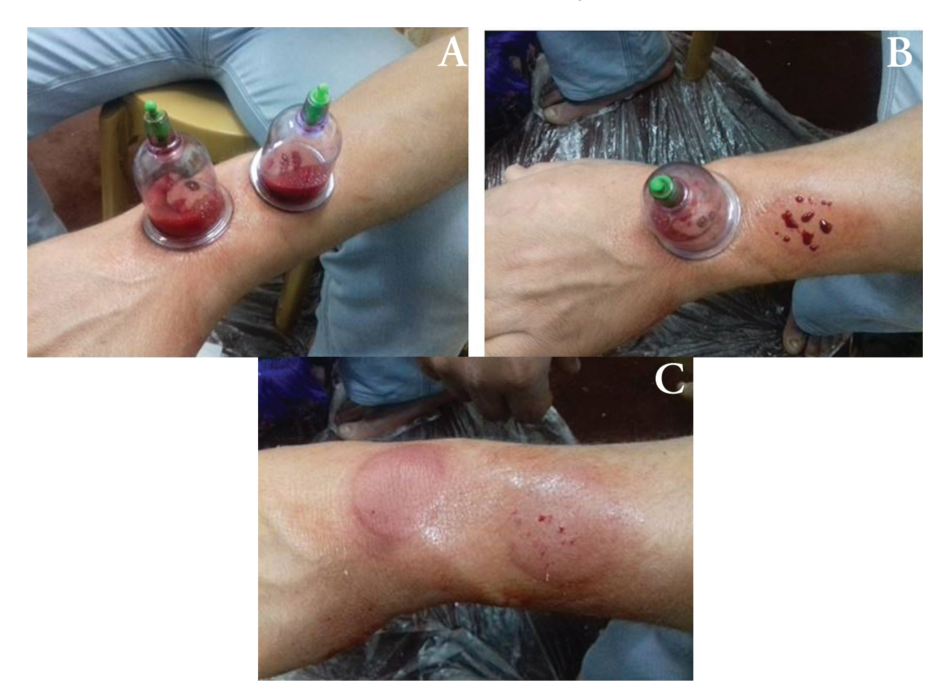
Figure 3 - Third step of Al-hijamah (2nd suction) to the back of the carpal region, A-B) Collecting the bloody excretion (filtered fluids + interstitial fluids + minor bloody drops due to skin scarification), C) Post-Al-hijamah signs disappear within few days.

carried out for that patient. He is now quite comfortable with a tolerable mild degree of pain and he does not need to do surgical intervention.