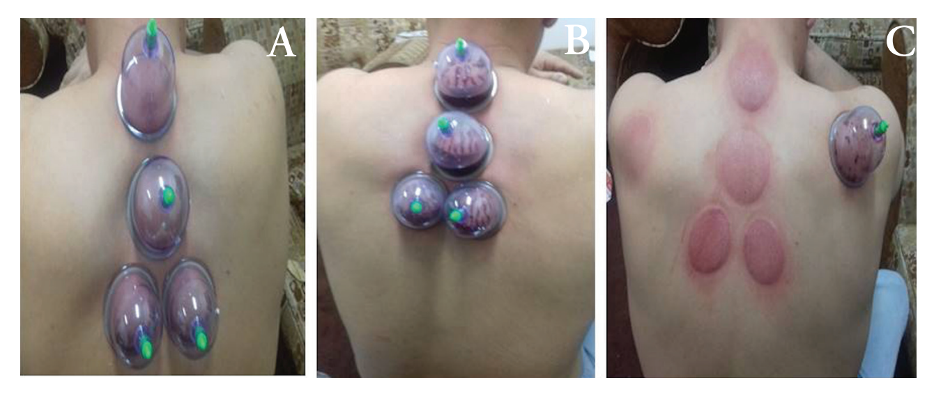
Figure 4 - Al-hijamah is also carried out at the general anatomical sites (upper back region and back of trapezius muscle). Sucking cups applied at the back region (A). A bloody excretion was coming out in the sucking cups after shartat mihjam (B). Post-Al-hijamah signs (demarcations induced by applying the sucking cups and the skin scarifications) disappear within few days (C).

from disease to disease). Cups put during Al-hijamah act as a kidney to excrete harmful substances using a physiological mechanism (pressure-dependent filtration at the dermal capillaries that resemble the fenestrated nephron capillaries). Moreover, Al-hijamah clears the tissues from pathological substances and decreases the interstitial pressure (Taibah mechanism). This clears the tissues ultimately and gives a chance for regaining physiological homeostasis. Recently, Al-hijamah was reported to greatly excrete oxidant substances and significantly decrease total antioxidant capacity.<sup>10</sup> Al-hijamah (skin suction, scarification and suction, triple S treatment) is more comprehensive and effective with better tissue and serum clearance effects than traditional wet cupping therapy (skin scarification and suction, double S treatment).<sup>6-7,10</sup>