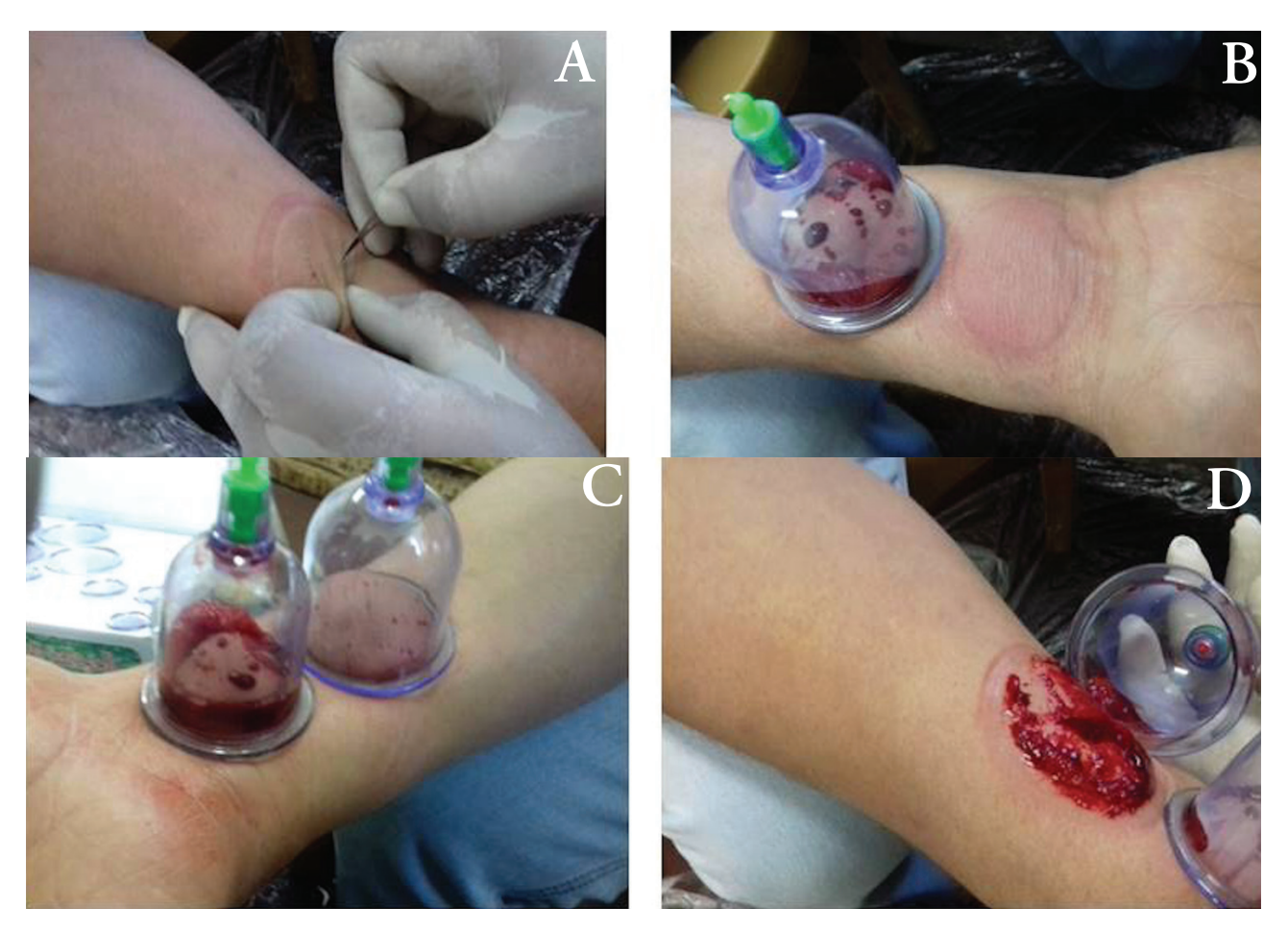
Figure 2 - Second step (shartat mihjam) and third step of Al-hijamah (2nd suction) to the anterior aspect of the carpal region. Scarification safety technique to guarantee preserving safety of the superficial contents of the carpal tunnel particularly the median nerve. Simply, the physician's left hand grasped the patient's skin up (away from vital carpal tunnel structures) while the physician's right hand scarified the grasped skin superficially (A). B-C-D) Collecting the bloody excretion (filtered fluids + interstitial fluids + minor bloody drops due to skin scarification) drawn inside the sucking cups.

superficial multiple scratches. That was carried out both in the frontal aspect and the back of the carpal region (Figure 2). Second suction of the scarified skin, a bloody excretion came out that was discarded inside the specific yellow bags. Sucking cups were then applied again and that was repeated (Figure 3). At the back region, same steps were carried out using large-sized sucking cups (Figure 4). A bloody excretion came out that was discarded inside the specific yellow bags. Sucking cups were applied again and that was repeated.