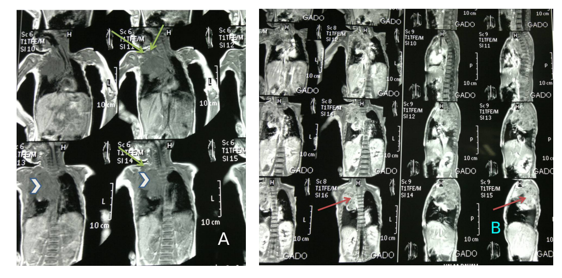
Figure 2 - Chest MRI (multiple sections through the chest and mediastinum). The examination showing A) large well defined soft tissue lesion about 8 * 6 * 5 cm (arrow head), have low signal intensity in T1W image with multiple signal void area in favouring of few spots of calcification, This mass being extra pulmonary lesion at the right side para-vertebral area showing extension upward occupying the right side upper posterio-superior thoracic gutter connecting to another mass at the right side supraclavicular area in favour of multiple discrete & matted involved lymph nodes (arrow) by metastasis that have the same mass criteria in signal intensity enhancement. B) The whole 2 bulk masses showing heterogeneous enhancement post contrast (arrow). There are no any surrounded bony changes. This large mass abutting the descending thoracic aorta displacing trachea to the left side.

Figure 1 - Chest X-ray posterior-anterior view showing rather a well defined large homogenous soft tissue opacity lesion in the right upper zone area (arrow) that have broad based toward mediastinum and making an obtuse angle with it. There are no any detected calcifications seen within the lesion. The mass have overlapped the upper thoracic spine but not Silhouetting the upper cardiac border suggested to be retro-cardiac. Note the widening of the right sided upper posterior rib interspace highly localizing mass lesion to be in the posterior mediastinum.