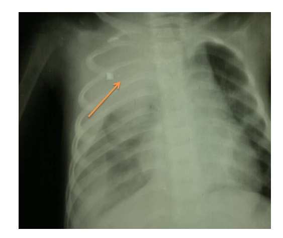
Figure 1 - Chest X-ray posterior-anterior view showing rather a well defined large homogenous soft tissue opacity lesion in the right upper zone area (arrow) that have broad based toward mediastinum and making an obtuse angle with it. There are no any detected calcifications seen within the lesion. The mass have overlapped the upper thoracic spine but not Silhouetting the upper cardiac border suggested to be retro-cardiac. Note the widening of the right sided upper posterior rib interspace highly localizing mass lesion to be in the posterior mediastinum.

examination of her lower limbs revealed flaccid paraparesis with loss of tone and reflexes and equivocal Babinski reflex on both sides. Sensory examination was difficult and non-conclusive and opsoclonus-myoclonus