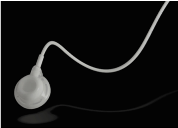
Figure 1 - BardPort™ intravenous catheter.