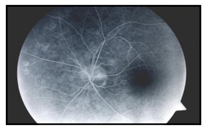
Figure 3 - Arterio-venous phase fluorescein angiogram of the (normal vision) left eye.

Three hundred and twelve patients with coronary artery bypass grafts were prospectively studied in (1985), for various neurological complications.<sup>2</sup> Such complications were found in 61% of the