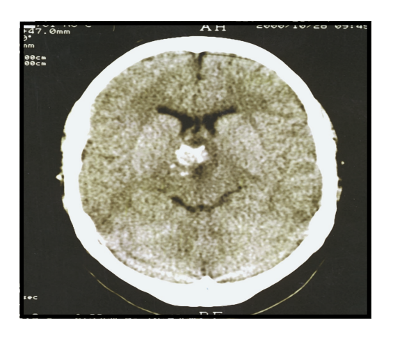
Figure 1 - Precontrast computerized tomography scan showing the cystic and calcified components of the tumor.