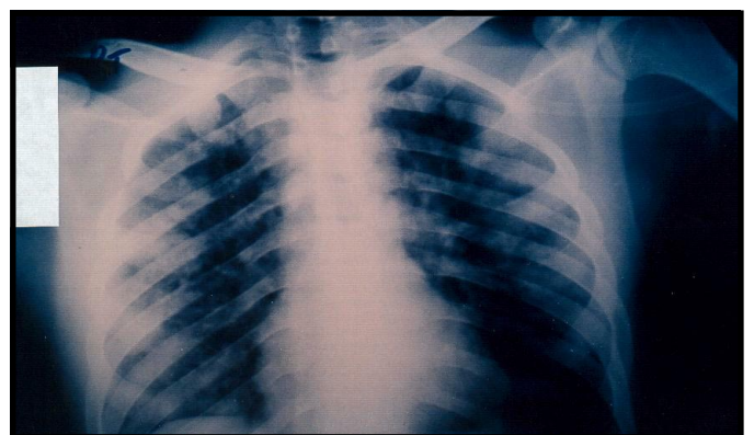
Figure 3 - Chest radiography showing the "snow-storm" appearance of pulmonary edema in fat embolism syndrome.