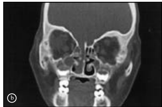
Figure 2 -Two-year-old girl with CSF rhinorrhea post fall from the third floor. a) Coronal T2-weighted MR image shows herniation of brain and meninges through a large defect in the right cribriform plate and ethmoidal fovea. Note the sulcal deformity secondary to the herniation. b) Coronal CT shows herniation of brain and meninges through the defect in the right cribriform plate and ethmoidal fovea. CSF - cerebrospinal fluid